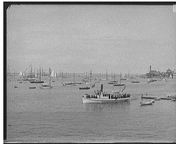
[New York Yacht Club fleet, Marblehead, Mass.]