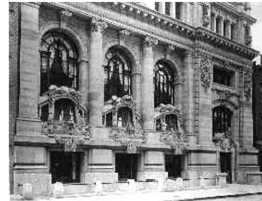
The West 44th St. club house opened in 1901

More interest followed. A meeting of the newly organized Power Squadron Conference Committee was held at the New York Yacht Club on 5 December 1913 and an outline of what was suggested at the meeting was forwarded to all who were interested. A second Conference Committee meeting was called for Monday, 2 February 1914, at the New York Yacht Club, and during the evening the final work of organizing and launching the United States Power Squadrons was accomplished. The meeting, which took place in the Commodore's Room, was called to order by Henry A. Morse of the Eastern Yacht Club and included representatives of squadrons and yacht clubs from Maine to Maryland. As one can read in the minutes, the organization was made complete by the election of the following officers: Chief commander, Roger Upton, Boston; vice commander, Holman F. Day, Portland; rear commander, Worthington Scott, New York City; treasurer, Charles F. Chapman, New York City; and secretary, Bryan L. Perman, Boston.